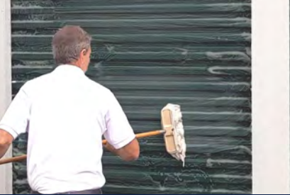
1 - Clean & Prepare the Door