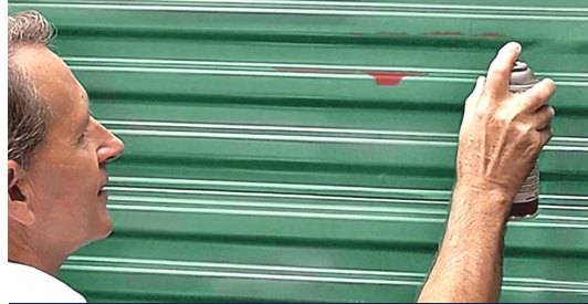
2 - Touch-up Scratches