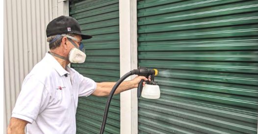
3 - Apply Door Restore Express